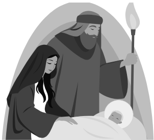
Wesoły Świąt Bożego Narodzenia