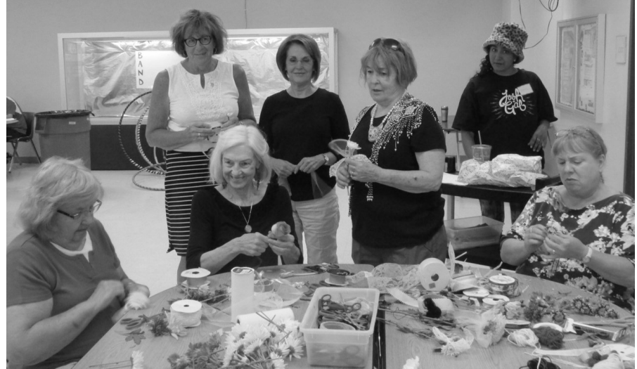
CC MEMBERS CREATE PROM DAY COURSAGES