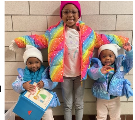
Twins and big sister model new coats from our Angels' Closet!

I am happy to report we have distributed over 250 coats this past coat season. Thank you to Knights of Columbus St. Sebastian Council who donated 140 coats to our inventory. On January 9th, 2024 we delivered 80 plus coats to St. James Ministries Wilksburg for their coat distribution January 20th. Also a big thank you to the students and faculty of Ingomar Elementary School In North Allegheny School District who collected and donated over 100 beautiful high quality hats, gloves, scarves and slippers (all sizes) from their giving tree to CCS..!!!! We shared some with St. James Ministries and will continue to use the items for our next distribution in the fall. Its been a great year for ANGELS' CLOSET!!! PS. A big thanks to all the committee members for your help.